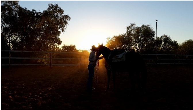
Rachel West, Glengyle Station