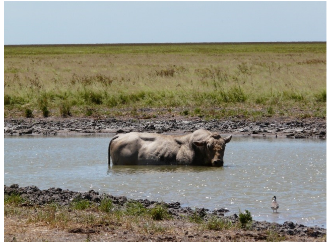
Ross Bambry, Brunchilly Station