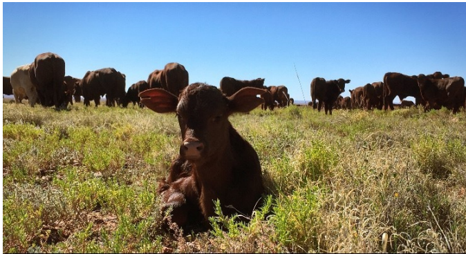
Gracie Morton, Innamincka Station