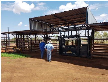
Hydraulic crush - No 26 Yard, Sturt Creek Outstation

Evaluation of kit form shade continues to optimise construction times. Solar pumps are replacing windmills and, in some cases, diesel pumps.