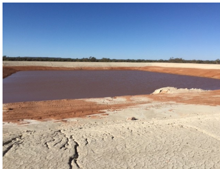
Tullanora Dam, Durham Downs Station