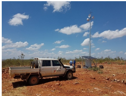
Digital UHF - Hughes Repeater, Ruby Plains Station

The Digital UHF system has been installed at Ruby Plains, Helen Springs, Brunchilly and Macumba. The remaining installations are on track for completion by the end of the financial year. The objective of 95% coverage over properties has been met, providing a mantle of safety for Kidman workers, and a better tool for station management.