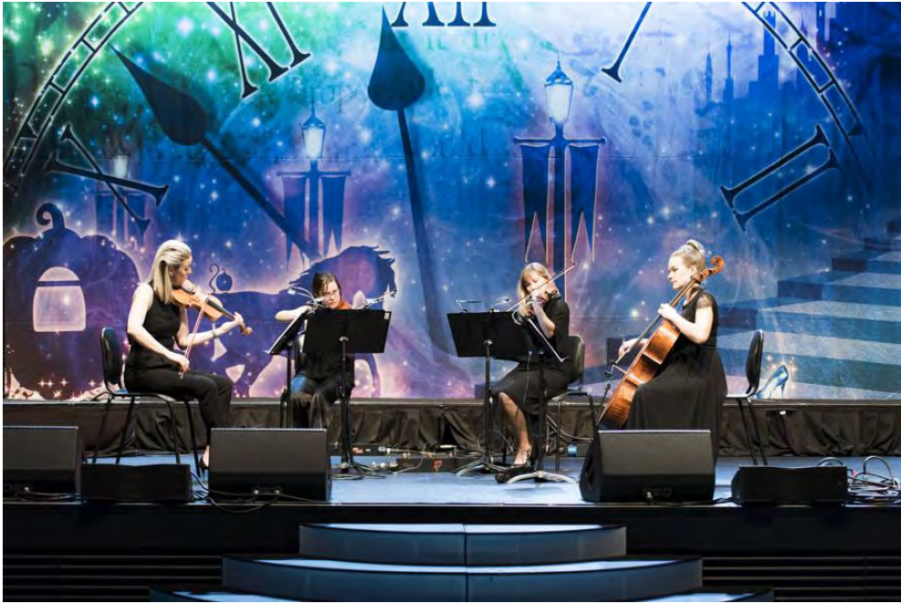
Perth Symphony Orchestra