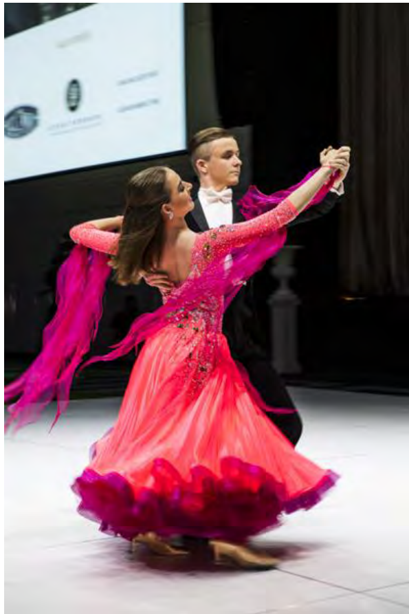
Professional dancers showing how its done