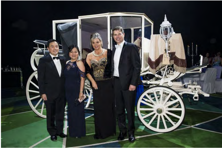
HPPL Team & Partners