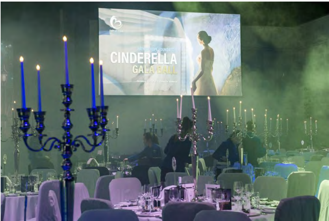
Crown Towers Ballroom