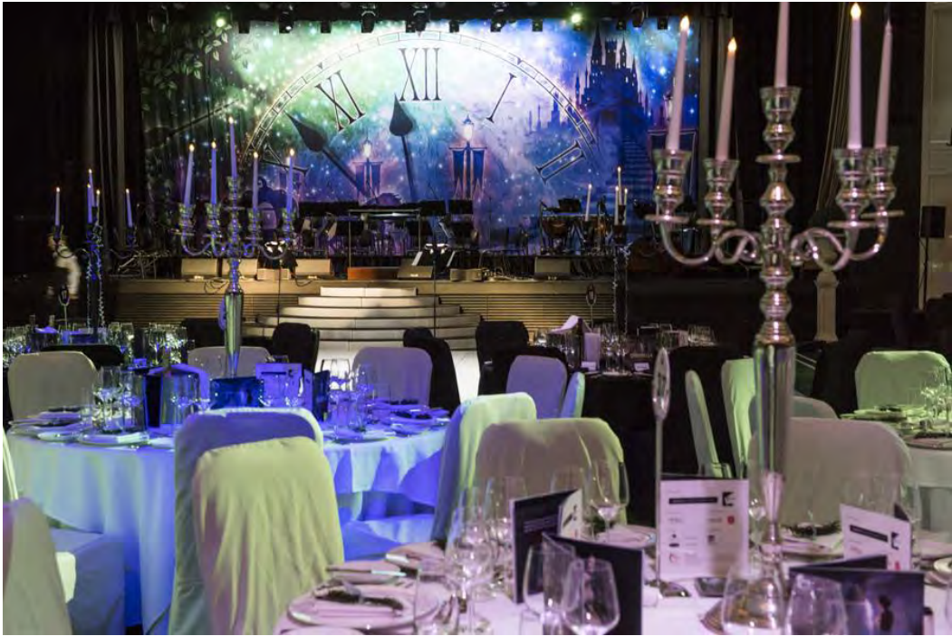
Crown Towers Ballroom