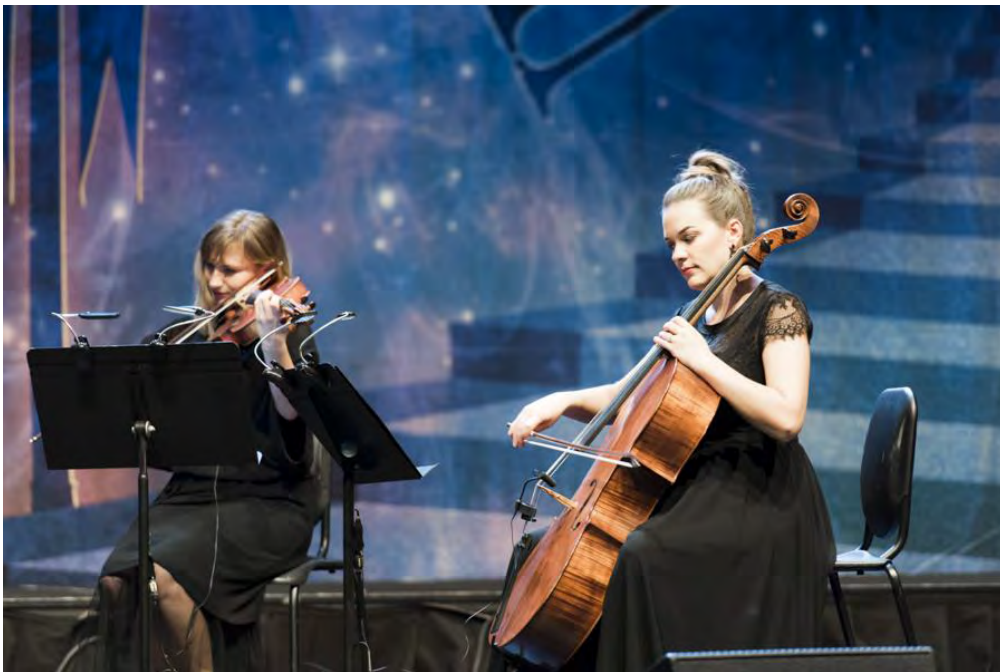
Perth Symphony Orchestra

It was a great evening with everyone proud to see our Chairman Mrs Rinehart, HPPL and Roy Hill supporting The Path of Hope.