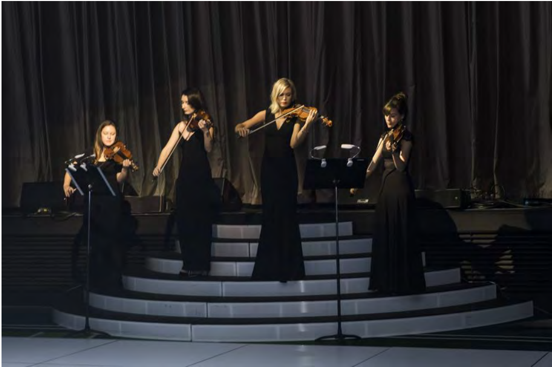
Perth Symphony Orchestra